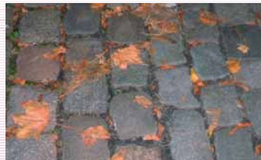
Noisy road surface