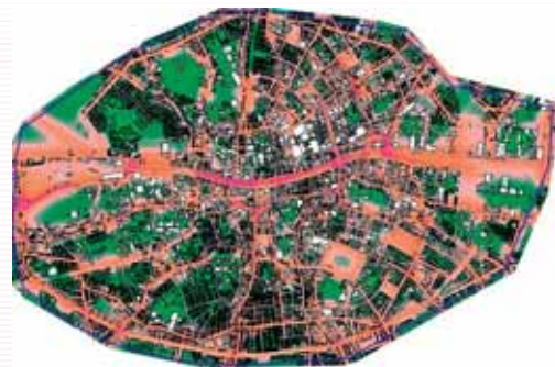
Noise map of the city centre (Dublin)

A detailed analysis of the delivery patterns and processes and the vehicle configurations in the inner city area of Dublin was made. The survey aimed to identify a logistics regime and configuration that justifies the use of urban delivery centres and more eco-friendly vehicles offering a more sustainable solution for managing freight deliveries in the historic city centre. The planning of the programme in Dublin has close relation with the experience of the PIEK programme in the Netherlands, which includes a consideration of 10 single issues to be taken into account in order to reduce noise emissions during loading and unloading at retail stores. The research in Dublin is designed to complement the PIEK experience because "no one size fits all".