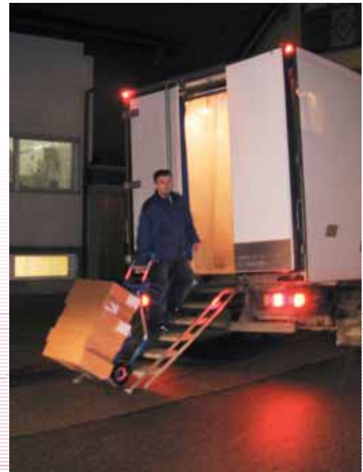
Conventional night time delivery