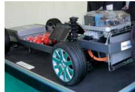
Fuel cell technology