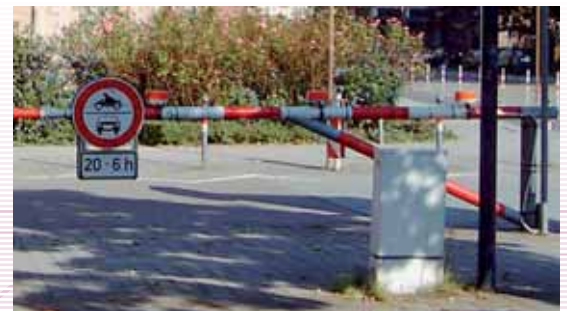
Barrier for an access restriction during night time (from 8 p.m. to 6 a.m.)

The introduction of night delivery leads to an increase of the delivery activities during the night and can therefore lead to more noise and more disturbances of the residents. The use of low noise equipment and additional noise reduction measures can mitigate or even overcome these negative side effects of night delivery.