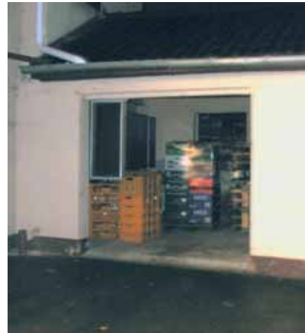
Receiving goods during night time