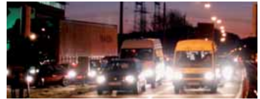
Early morning rush hour